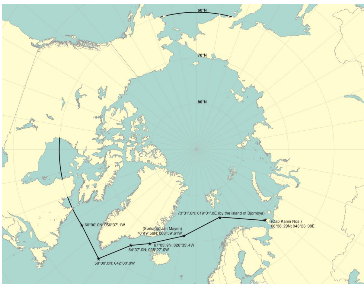
Figure 2 – Maximum extent of Arctic waters application 3